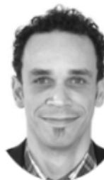
David Folio Use IEEEbiography with figure as option and the author name as the argument followed by the biography text.

John Doe Use IEEEbiographynophoto and the author name as the argument followed by the biography text.