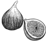
Fig. 1: An example of figure.